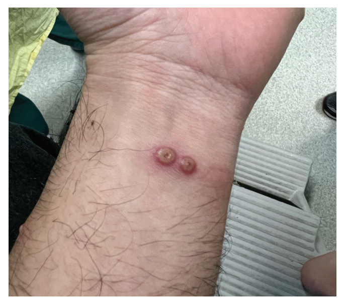
Figure 2: Photograph of the flexor surface of the left wrist of a 33-year-old man with monkeypox showing two 10mm pustular lesions with central umbilication, captured on day 7 following the emergence of the lesions (illness day 10)