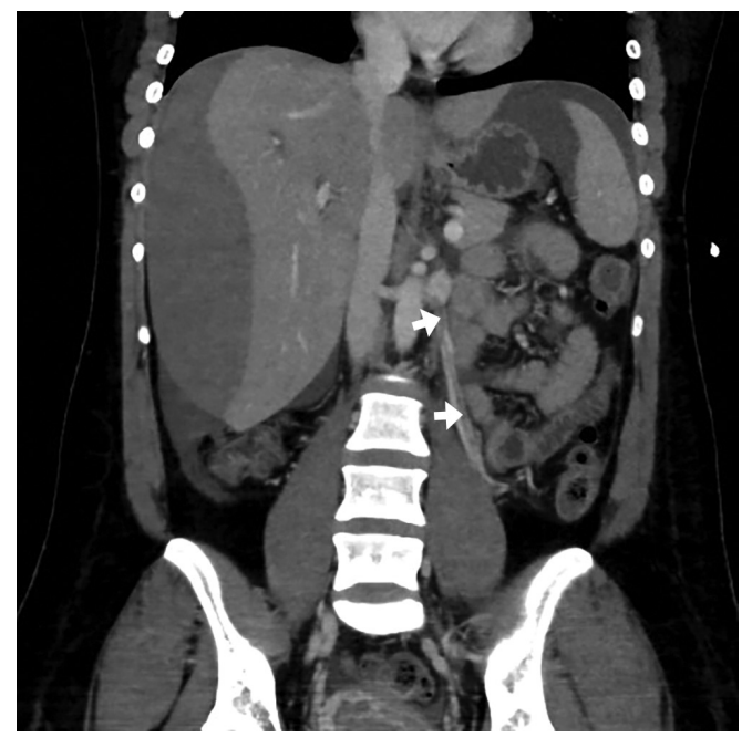
Figure 2: Coronal portal venous phase computed tomography scan of a 39-year-old woman on postpartum day 2 showing gonadal vein thrombus (arrows) and stable appearance of hepatic hematoma.

hepatic artery. These sites were embolized successfully with a slurry of hemostatic absorbable gelatin powder.